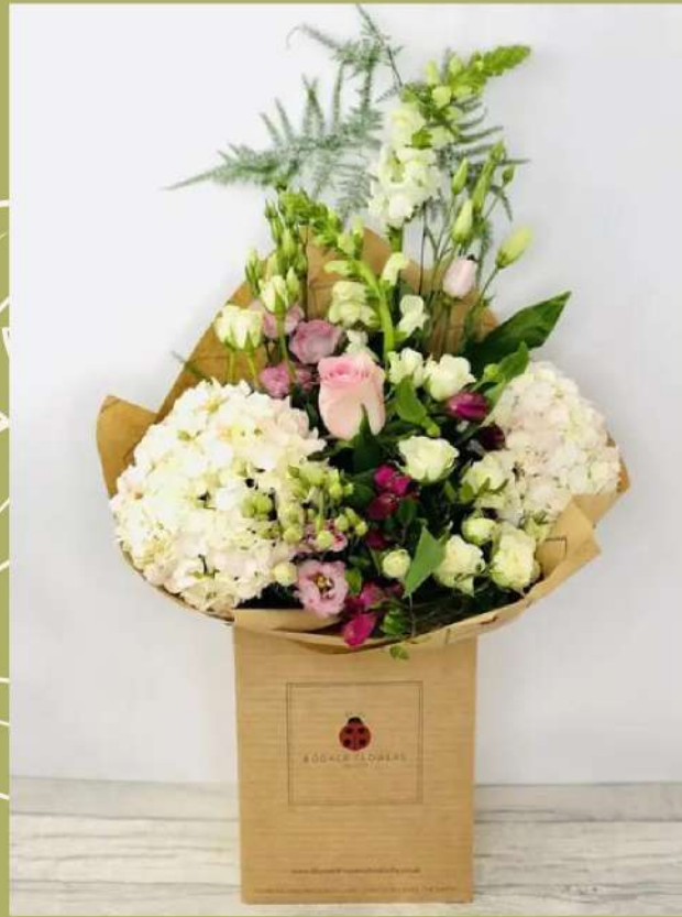
Medium Size £60 - £80