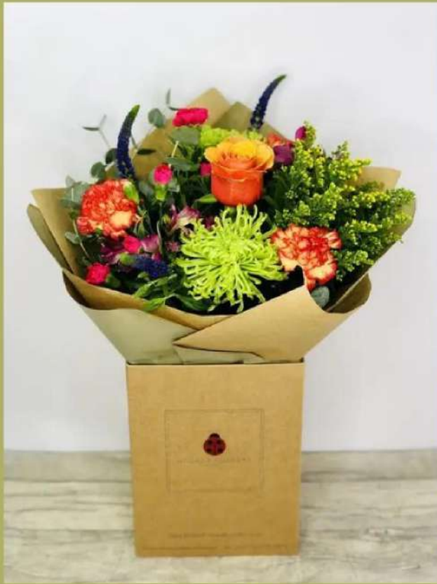
Standard Size £40 - £50