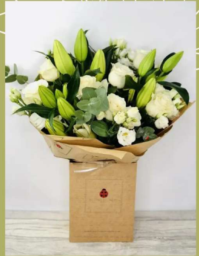
Large Size £80 - £100+